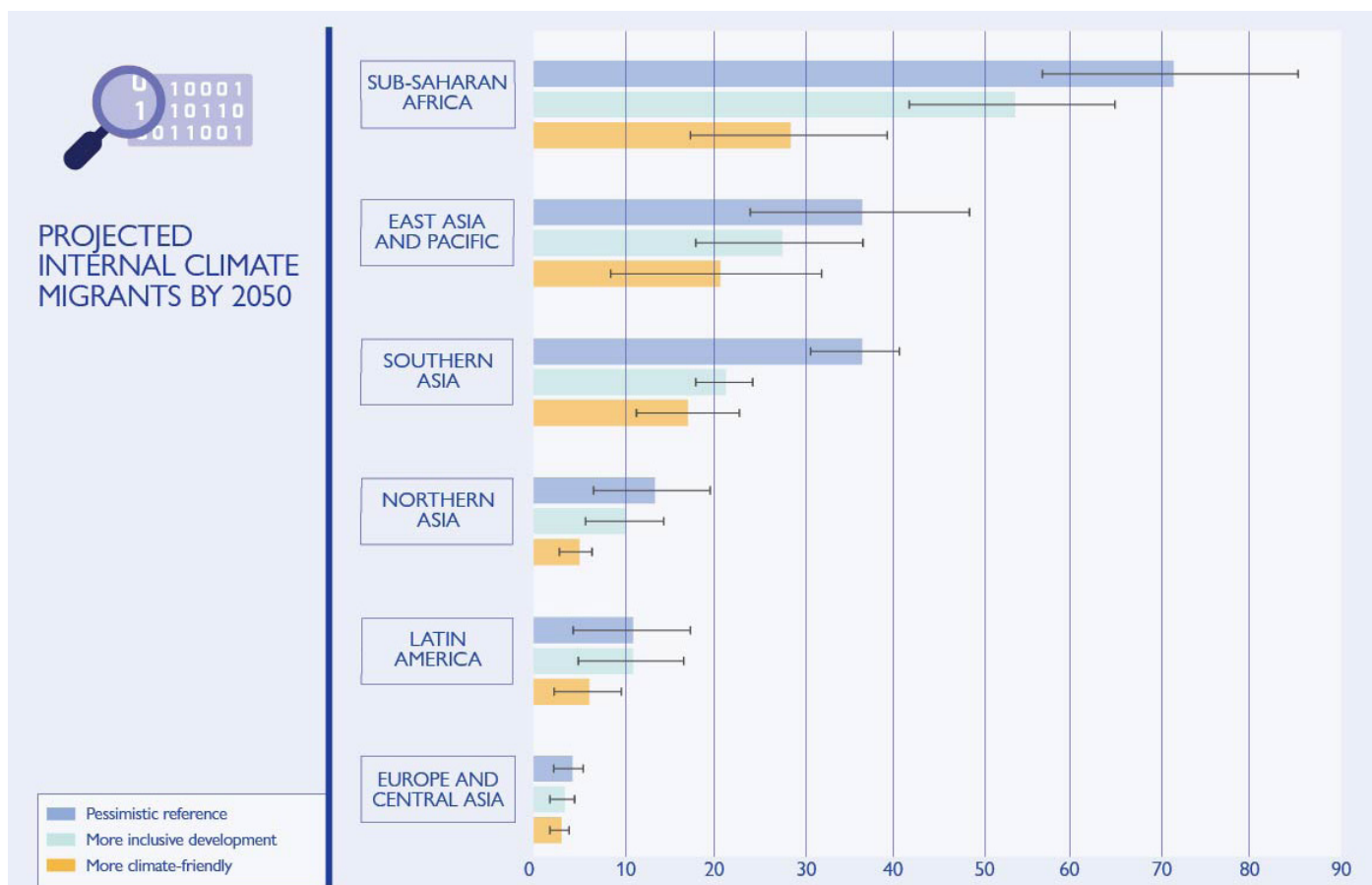
Figure 2: Projected internal climate migrants by 2050