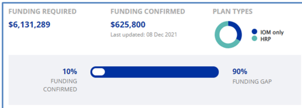
Example of funding progress for CCCM activities in Mozambique 2021 CRP

The GCRP dashboards enable a variety of filter options including by region, country, objective, activity area, type of people targeted, etc, all of which are of interest to donors, partners and to IOM itself.