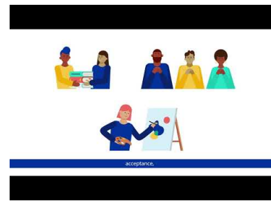
IOM Manual on Community-Based MHPSS in Emergencies and Displacement – Chapter 1