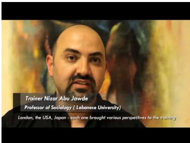
Syria: Executive Professional Masters in Psychosocial Support and Dialogue