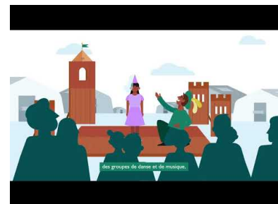
Manuel de l'OIM sur les SMSPS dans les situations d'urgence et de déplacement – Chapitres 5 à 7