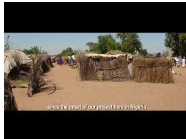
PSS Mobile Teams- Nigeria