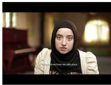
Lebanon: Letter from a Refugee