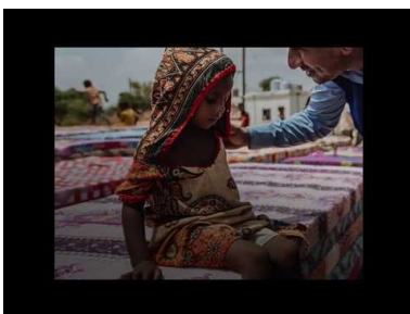
Le travail de protection de l'OIM dans la réponse aux situations de crise