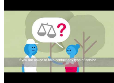
Responding to Disclosure of a GBV Incident