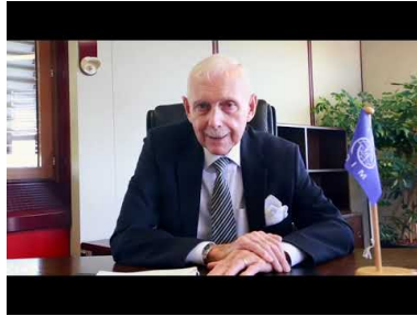
Launch of IOM's Institutional Framework for Gender Based Violence in Crises (GBViC)