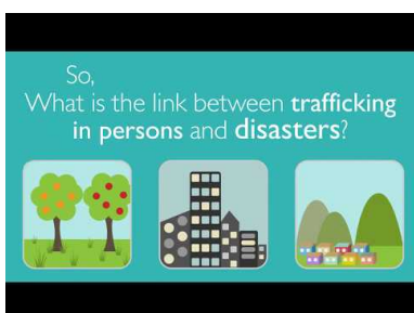
Trafficking in persons in contexts in crisis