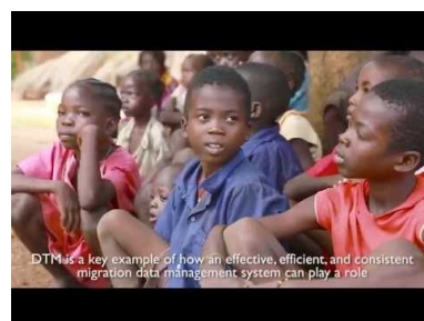
Displacement Tracking Matrix (DTM)