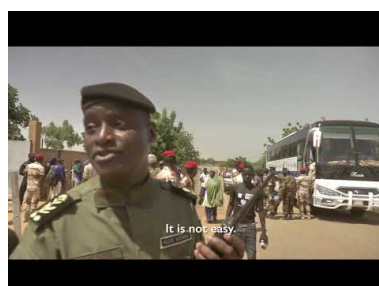
IOM Niger - Simulation exercise - Tillabéri - 2018