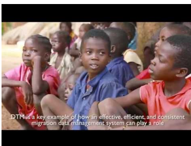
Displacement Tracking Matrix (DTM)