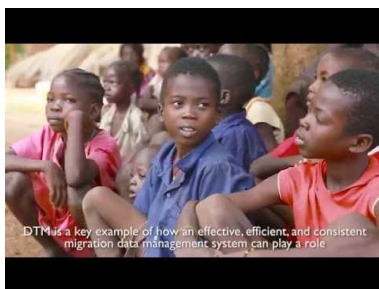
Displacement Tracking Matrix (DTM)