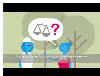
Responding to Disclosure of a GBV Incident