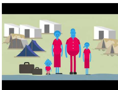
Site Planning in Emergencies