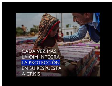
La labor de protección de la OIM en su respuesta a crisis