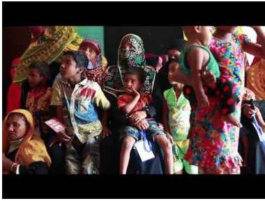
Protection is central to IOM's response to crises