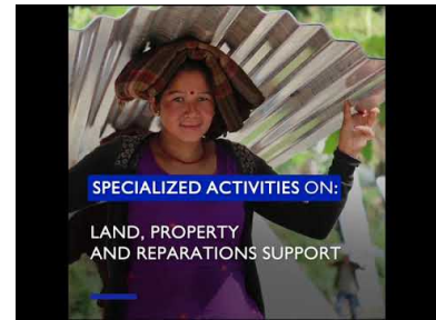
IOM's work on protection in crisis response