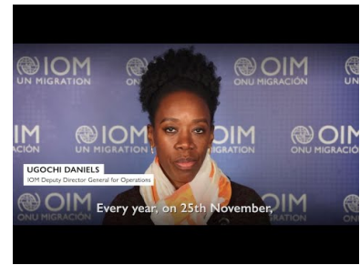
DDG Message on 16 Days of Activism Against GBV