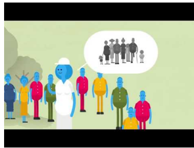
Distribution of Non-Food Items (NFIs) for Shelter