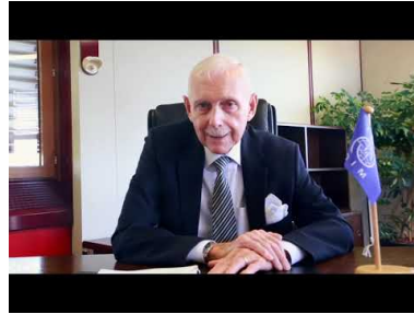
Launch of IOM's Institutional Framework for Gender Based Violence in Crises (GBViC)