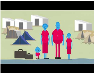
Site Planning in Emergencies