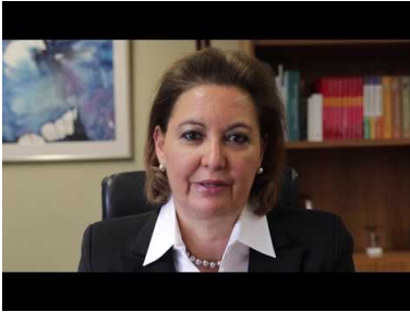
IOM's Commitment to Addressing Gender-Based Violence in Crises