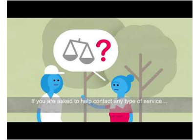
Responding to Disclosure of a GBV Incident