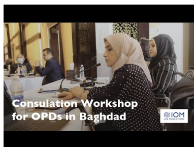
Consultation Workshop for Organizations of Persons with Disabilities, Baghdad | IOM Iraq