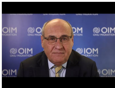
IOM Director General's Message on International Day of Persons with Disabilities 2022