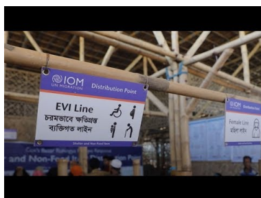
Dignity and Respect for Refugees with Disabilities