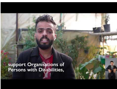
"Nothing About Us, Without Us" – Organizations of Persons With Disabilities in Iraq