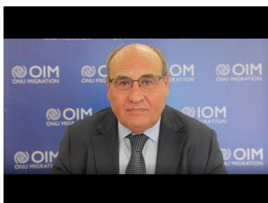
International Day of Persons with Disabilities - Message from IOM Director General Vitorino