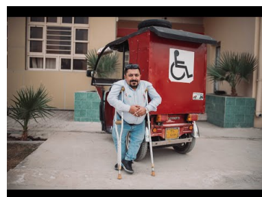
International Day for Persons with Disabilities.