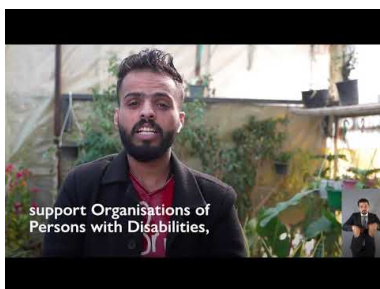
"Nothing About Us, Without Us" – Organizations of Persons With Disabilities in Iraq