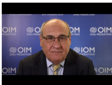
IOM Director General's Message on International Day of Persons with Disabilities 2022