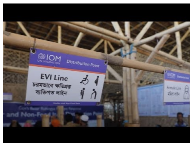
Dignity and Respect for Refugees with Disabilities