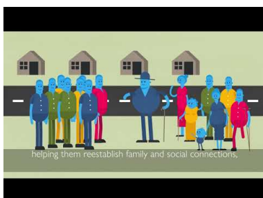
Peacebuilding to Prevent and Resolve Conflict – IOM’s Approach