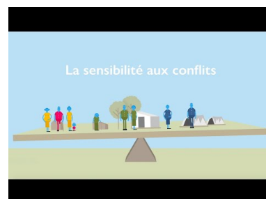
Conflict Sensitivity Training Video – French