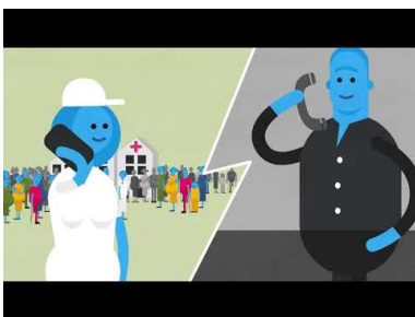
IOM and the Humanitarian-Development-Peace Nexus