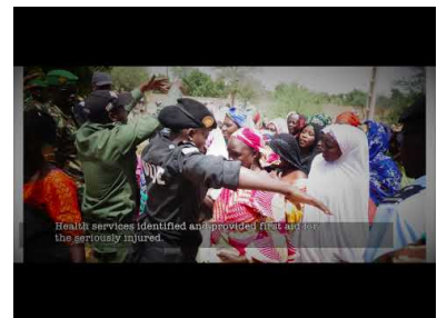
Flintlock: the simulation exercise