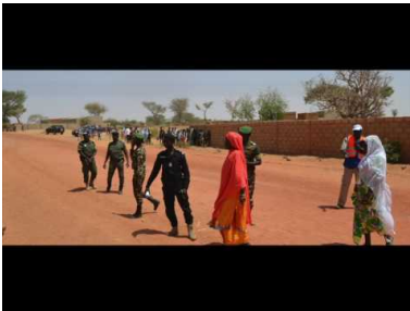
Simulation Exercise EN