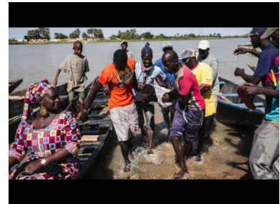
Crisis simulation exercise at the border, Dagana, 11/30/2016