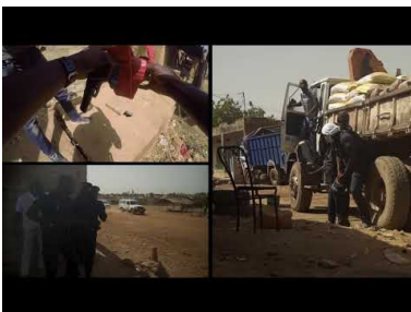
Crisis simulation exercise at the border in Kidira, December 13 2017