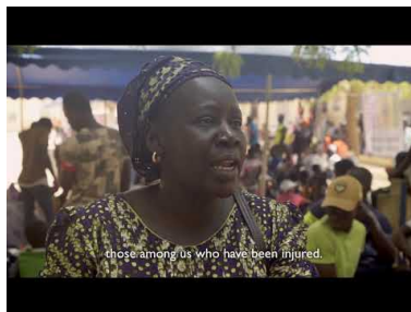
IOM Crisis Simulation in Podor, Senegal