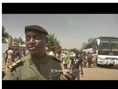
IOM Niger - Simulation exercise - Tillabéri - 2018