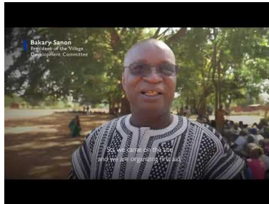
IOM Crisis Simulation Exercise in Burkina Faso