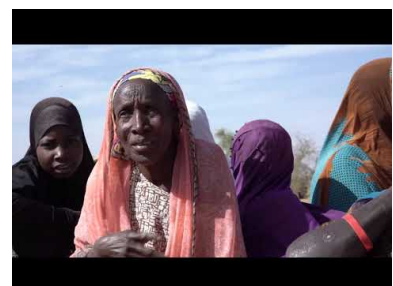
Exercice de simulation de crise transfrontalière : Kolama/Tahoua, 12 novembre 2020