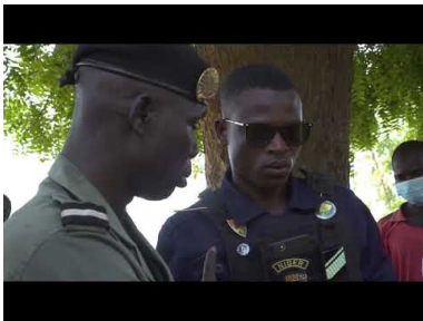
Exercice de simulation de crise transfrontalière : Maradounfa/Maradi