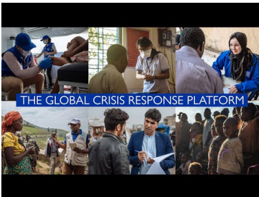
The Global Crisis Response Platform