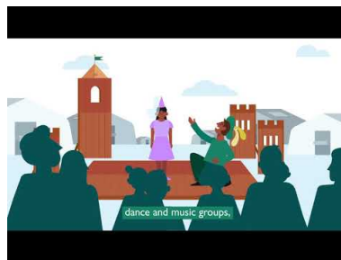
IOM Manual on Community-Based MHPSS in Emergencies and Displacement – Chapters 5 through 7