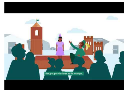
Manuel de l'OIM sur les SMSPS dans le situations d'urgence et de déplacement – Chapitres 5 à 7