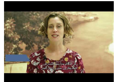
IOM Training in Psychosocial Support, dialogue and social cohesion in Lebanon