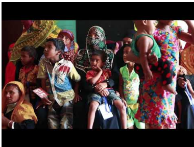
Protection is central to IOM's response to crises