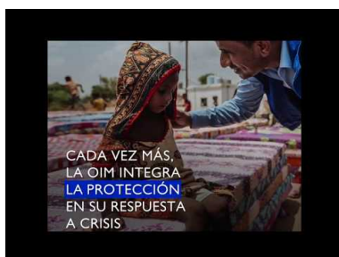
La labor de protección de la OIM en su respuesta a crisis