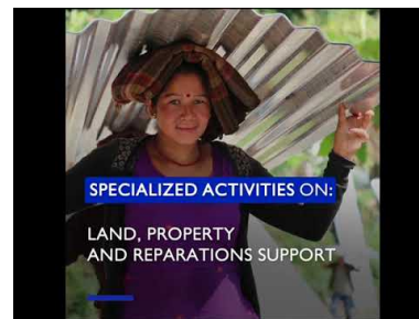
IOM's work on protection in crisis response