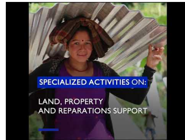
IOM's work on protection in crisis response