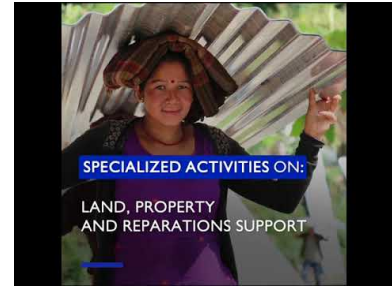
IOM's work on protection in crisis response