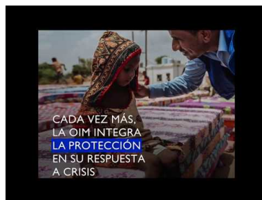
La labor de protección de la OIM en su respuesta a crisis