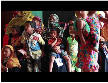
Protection is central to IOM's response to crises