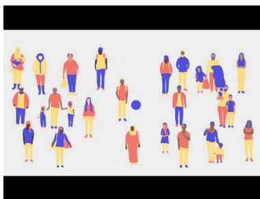
Migrants in Countries in Crisis: Why is This Important