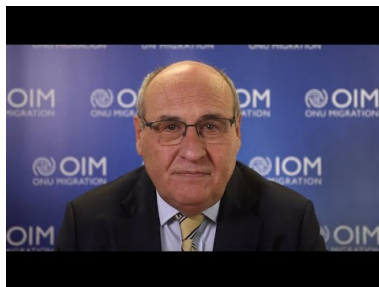
IOM Director General's Message on International Day of Persons with Disabilities 2022