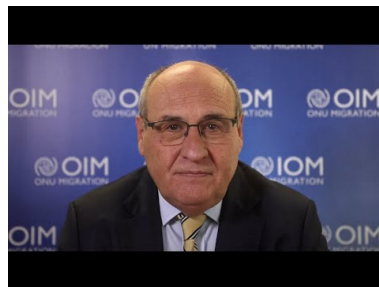
IOM Director General's Message on International Day of Persons with Disabilities 2022