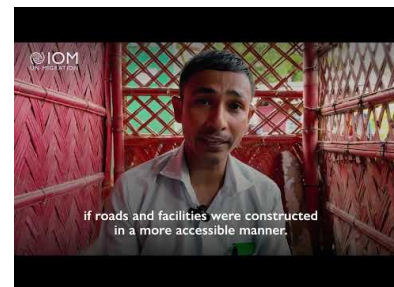
Disability inclusion: Accessibility audit in Rohingya camps, Cox's Bazar