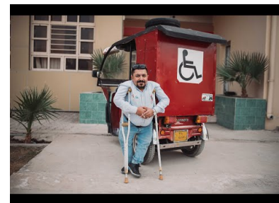
International Day for Persons with Disabilities.