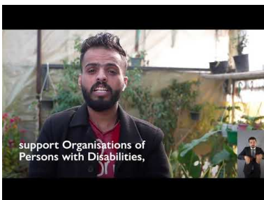
"Nothing About Us, Without Us" – Organizations of Persons With Disabilities in Iraq