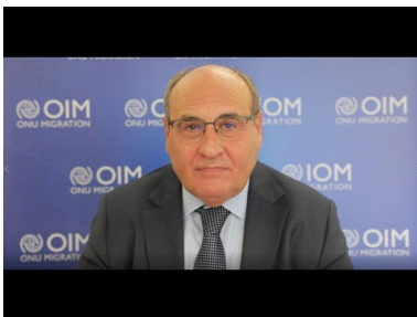
International Day of Persons with Disabilities - Message from IOM Director General Vitorino