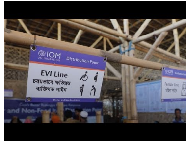
Dignity and Respect for Refugees with Disabilities