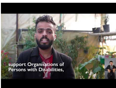
"Nothing About Us, Without Us" – Organizations of Persons With Disabilities in Iraq