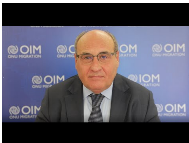
International Day of Persons with Disabilities - Message from IOM Director General Vitorino