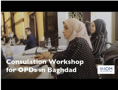
Consultation Workshop for Organizations of Persons with Disabilities, Baghdad