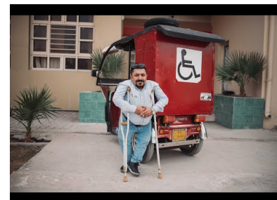
International Day for Persons with Disabilities.