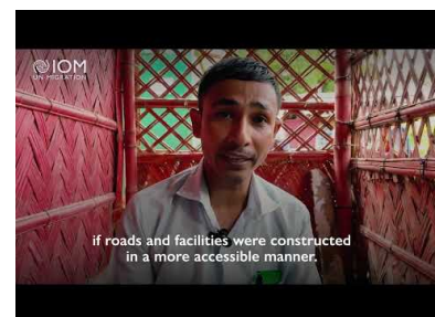
Disability inclusion: Accessibility audit in Rohingya camps, Cox's Bazar