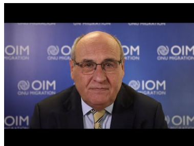
IOM Director General's Message on International Day of Persons with Disabilities 2022