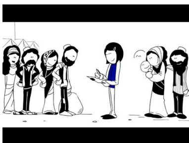
IOM's Principles for Humanitarian Action