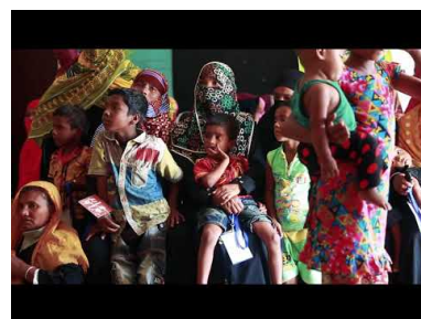
Protection is central to IOM's response to crises