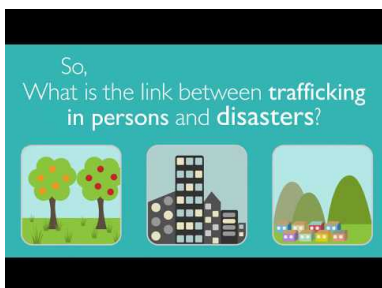
Trafficking in persons in contexts in crisis