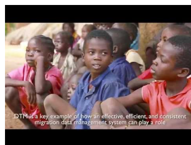
Displacement Tracking Matrix (DTM)