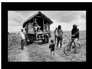
Philippines: Deeper Scars