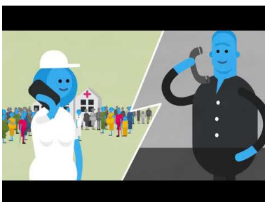
IOM and the Humanitarian-Development-Peace Nexus