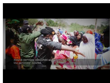
Flintlock: the simulation exercise