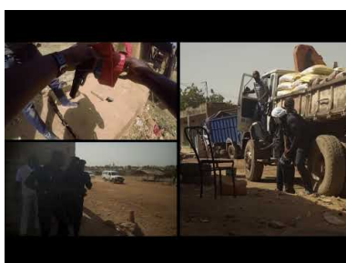
Crisis simulation exercise at the border in Kidira, December 13 2017