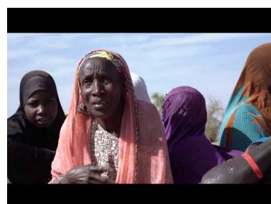
Exercice de simulation de crise transfrontalière : Kolama/Tahoua, 12 novembre 2020