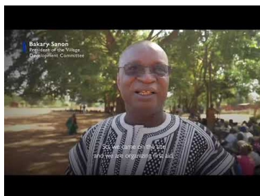
IOM Crisis Simulation Exercise in Burkina Faso