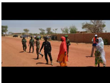
Simulation Exercise EN