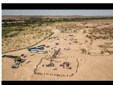
IOM Niger - Agadez Simulation Exercise - English