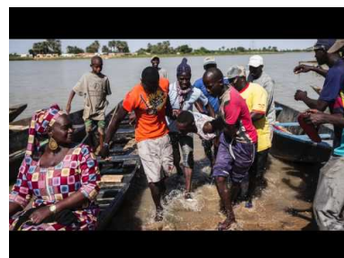
Crisis simulation exercise at the border, Dagana, 11/30/2016