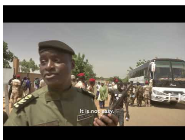
IOM Niger - Simulation exercise - Tillabéri - 2018