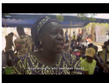
IOM Crisis Simulation in Podor, Senegal