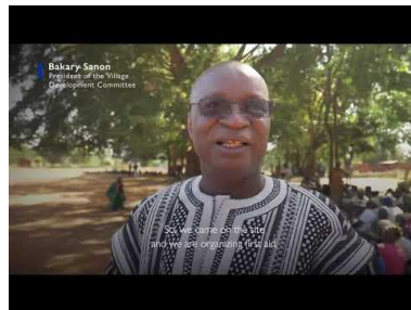
IOM Crisis Simulation Exercise in Burkina Faso