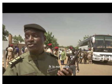
IOM Niger - Simulation exercise - Tillabéri - 2018