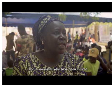
IOM Crisis Simulation in Podor, Senegal