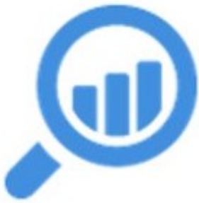
1 | Risk Monitoring