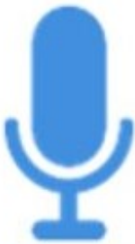
7 | Advocacy & Communication