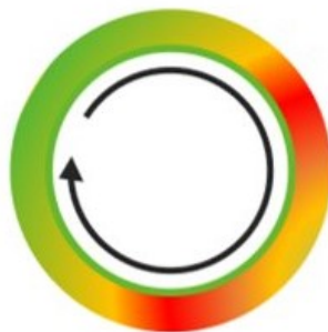
Figure 1 - Different Phases of an Emergency (Theory & Practice)