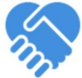
6 | Partnerships