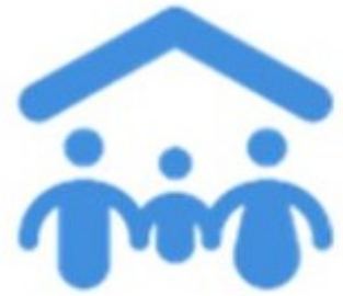
3 | Programs & Sector