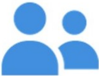
4 | Human Resources