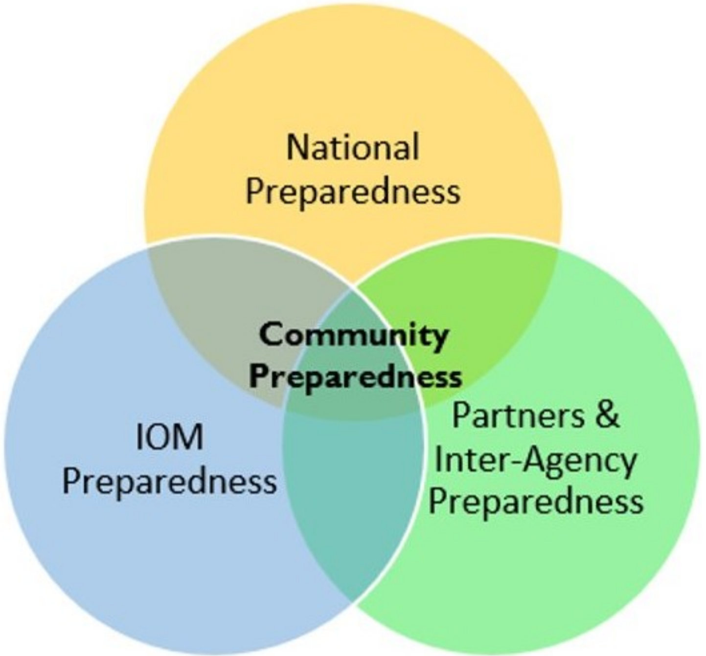
Figure 2 - Linkages between preparedness plans