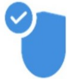
9 | Security & Business Continuity Plans