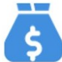
8 | Resources Mobilization