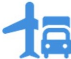
5 | Supply & Logistics