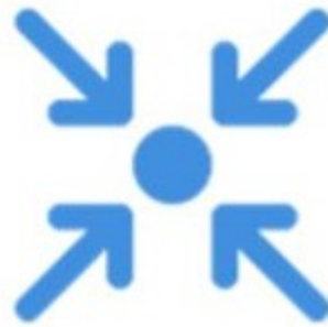
2 | Coordination & Management Arrangements